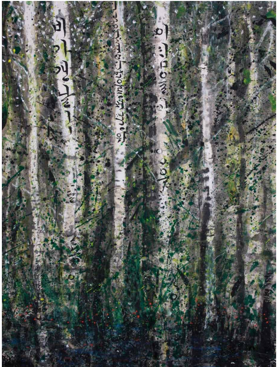
"Forêt de Corée", 2004, 140cm x 100cm. Ink and watercolor on paper.